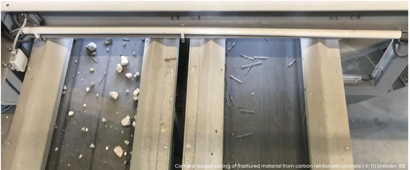
Camera-based sorting of fractured material from carbon reinforced concrete